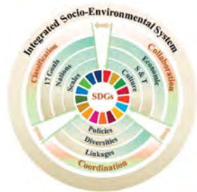
A systems approach for advancing the SDGs: Classification–Coordination–Collaboration.

Among the 3C constituents, classification is the foundation, aiming to identify the main features of the different SDGs, the differences between countries, and the influence of scale. Coordination is the core link, aiming to ensure policy coherence among countries and departments by formulating reasonable policies. Collaboration is the means necessary to achieving the SDGs as a whole. This approach calls for significantly greater collaboration in economy, science & technology and culture. In addition, each constituent interacts with the others. For example, classification